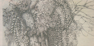
Bamboo Series #2