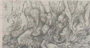
Bamboo Series #1