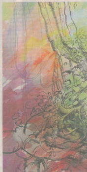
Bamboo Series #28

Her Sunny Day series from 1972 to 1981, Diary series from the '80s through the '90s, and Dragon series from the '90s see her switching from