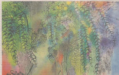
Bamboo Series #27

Admission is free. Visiting hours are from 9am to 5pm on weekdays. For details, call 04-226 2462.