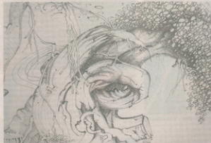
Bamboo Series #3