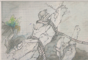
Bamboo Series #25