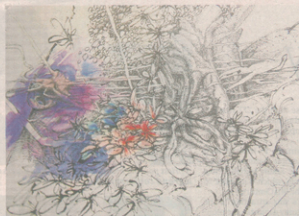
Bamboo Series #7